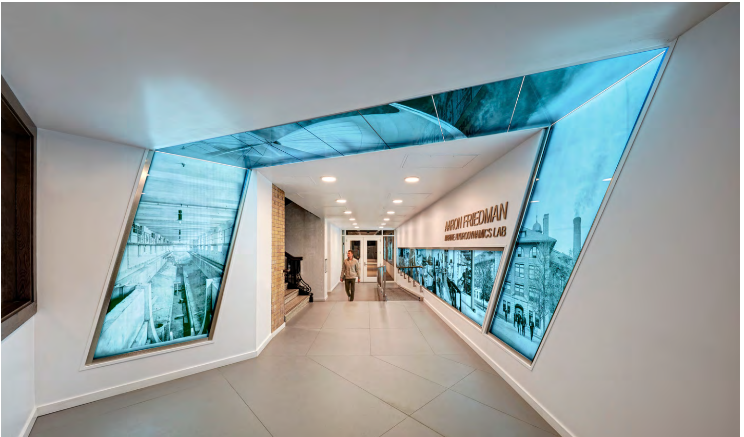
The Aaron Friedman Marine Hydrodynamics Lab - Experiential Graphics University of Michigan

This cultural aspect of environmental graphic design has tangible effects on employee engagement and retention. Research from Gallup has shown that employees are more likely to stay with companies whose values align with their own.