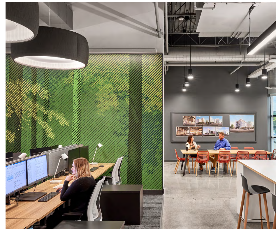
Detroit Office Relocation HED

Practically speaking, at a minimum, environmental graphic design plays a crucial role in facilitating navigation and ease of use within the hybrid workplace. If employees come to work an environment that they don’t see regularly, how can we expect them to feel a sense of ownership in the space? They don’t know where the restrooms are, they can’t find coffee mugs, they feel like awkward guests in an environment they’re supposed to feel at home in. With employees spending less time physically present in the office or coming in sporadically, it’s essential that when staff do return, the space is intuitive and anxiety-free.