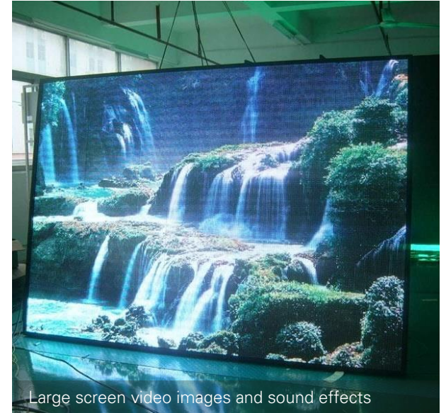
Large screen video images and sound effects