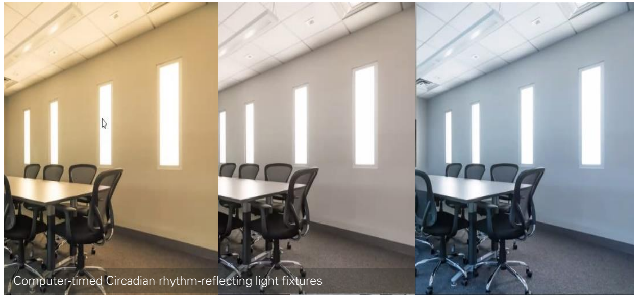
Computer-timed Circadian rhythm-reflecting light fixtures